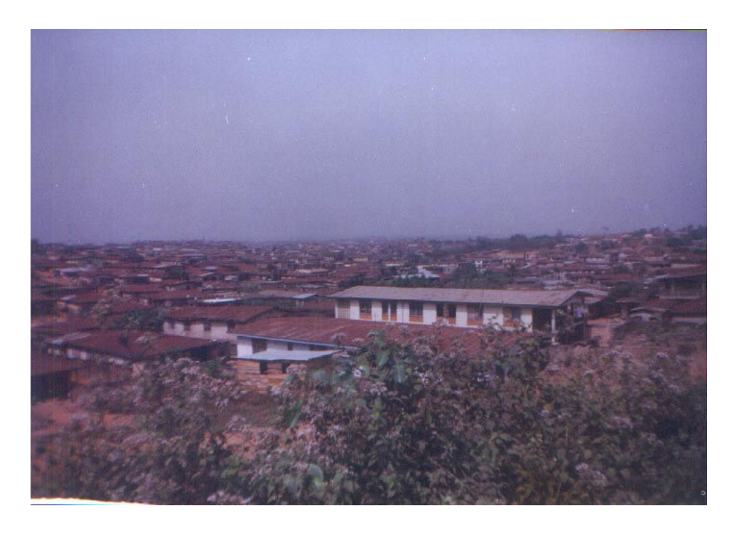
Plate IV: Overcrowded and deplorable housing situation in some parts of Ibadan city