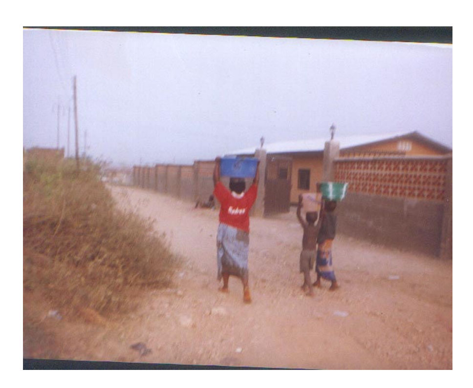
Plate I: Women and children trek long distance to fetch water in some places in Ibadan

where they exceeded 5.5 percent per year in 1985-90 (Obudho 1996). By the year 2025, 54.0 percent of the African population will reside in urban areas (UNCHS 1991). The average percentage figure for the African continent which is 54.0 percent is even lower than that for Nigeria which is 61.6 percent (UNCHS 1991). Consequently, there has been rapid expansion of Nigerian cities' areal extent which is now sometimes ten fold their initial point of growth (Egunjobi 1999; Ogunsanya 2002; Oyesiku 2002). A crucial aspect of this is that city growth is largely uncontrolled (Egunjobi 1999; 2002); and so the cities are characterized by slum housing conditions, limited coverage of urban services, unreliable service provision, general environmental deterioration, confused transport systems etc. Women and children trek long distance to fetch water (Plate I).