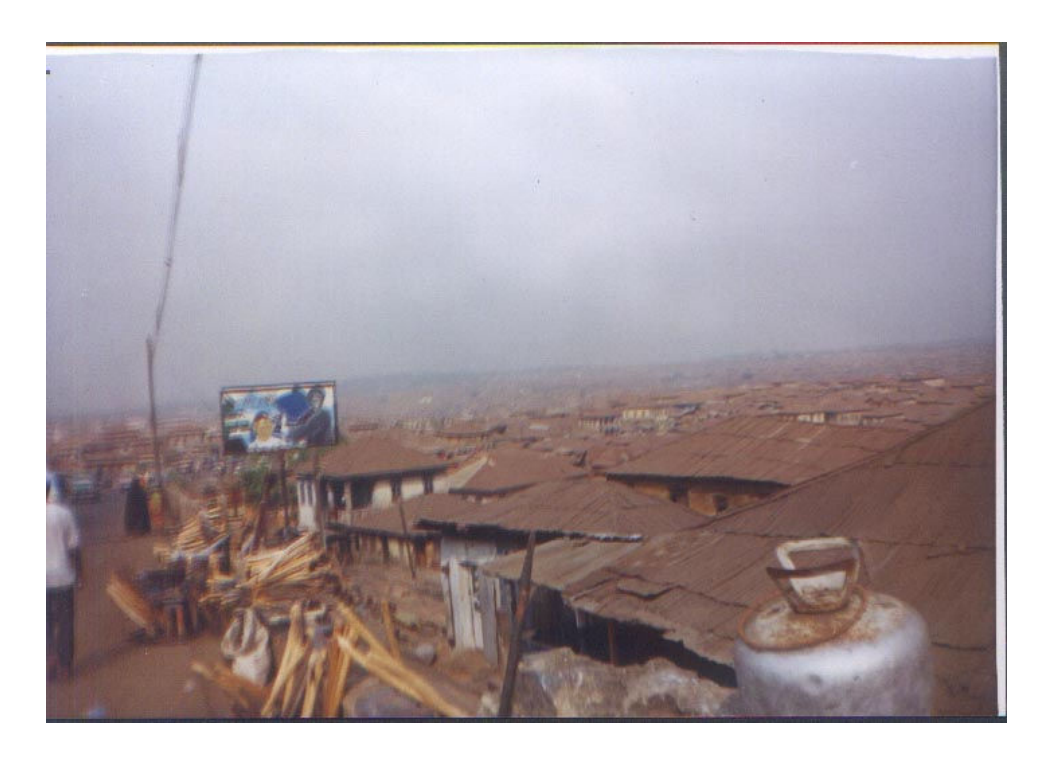
Plate III: Overcrowded and deplorable housing situation in some parts of Ibadan city